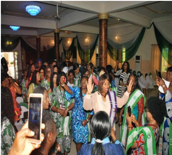
MWIA President being welcomed with dancing at the MWAN NEC