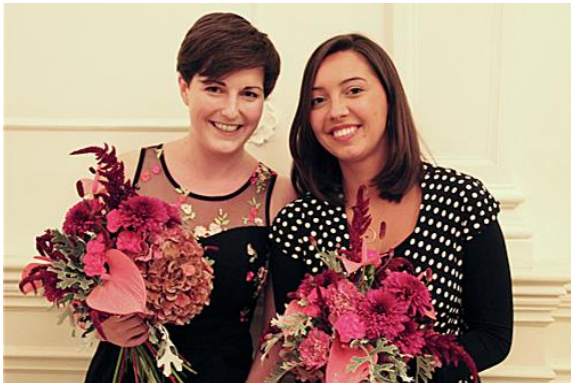
Photos from centenary meeting