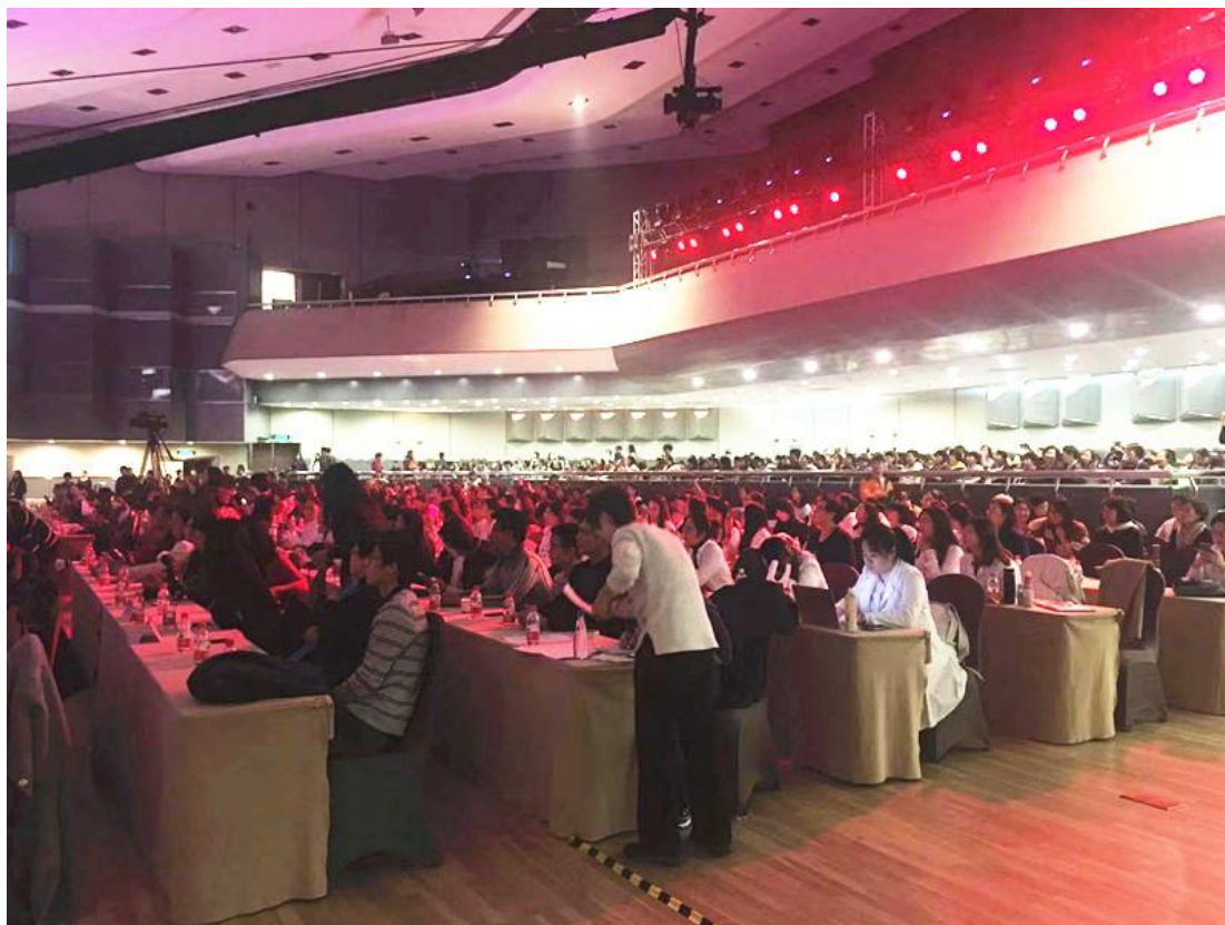
1200 participants attended the opening ceremony of CMWA