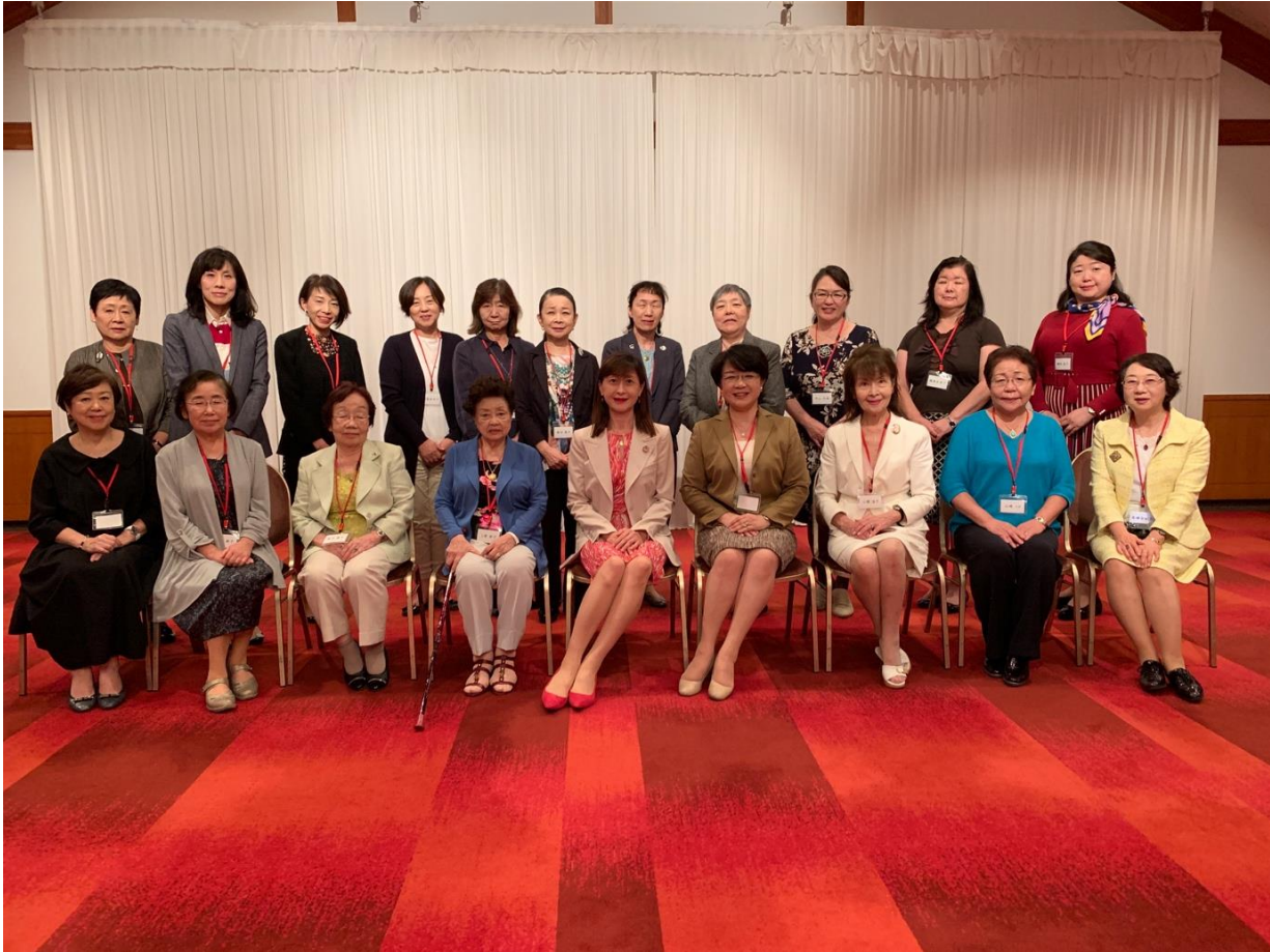
“JMWA Seminar in Karuizawa” was held in Nagano prefecture on Oct. 5 th .