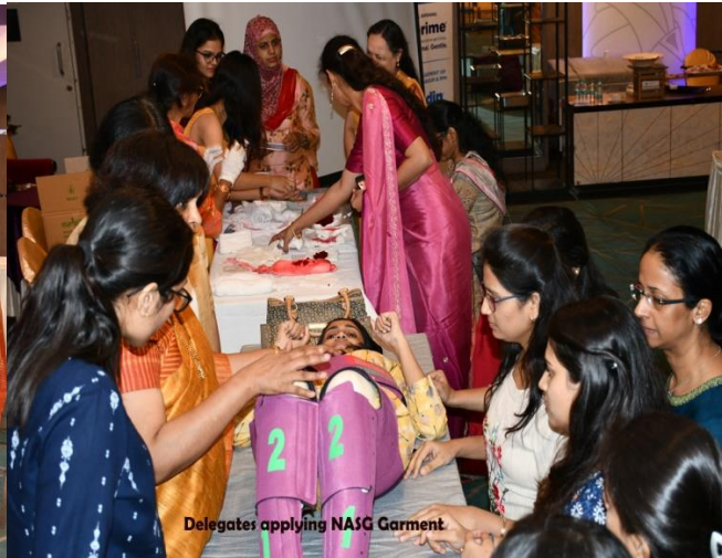
Delegates applying NASG Garment