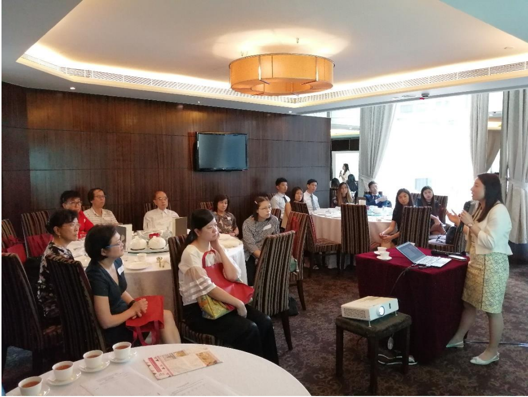
(3) The 13th Annual General Meeting cum Annual Dinner of the Hong Kong Women Doctors Association