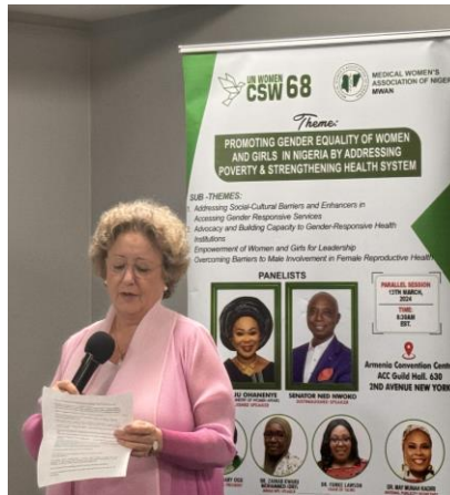
Presenting at the MWAN UN CSW parallel event 2024