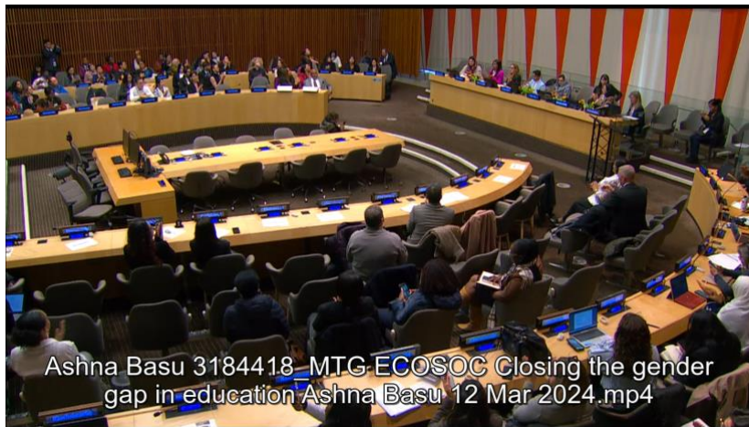
Ashna Basu 3184418_MTG-ECOSOC Closing the gender gap in education Ashna Basu 12 Mar 2024.mp4